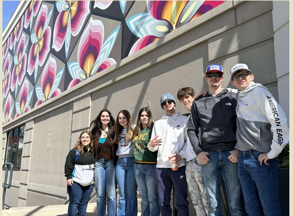
The senior class on their senior trip to Salt Lake City, UT.

NO MATTER HOW LONG WINTER IS, SPRING IS SURE TO FOLLOW